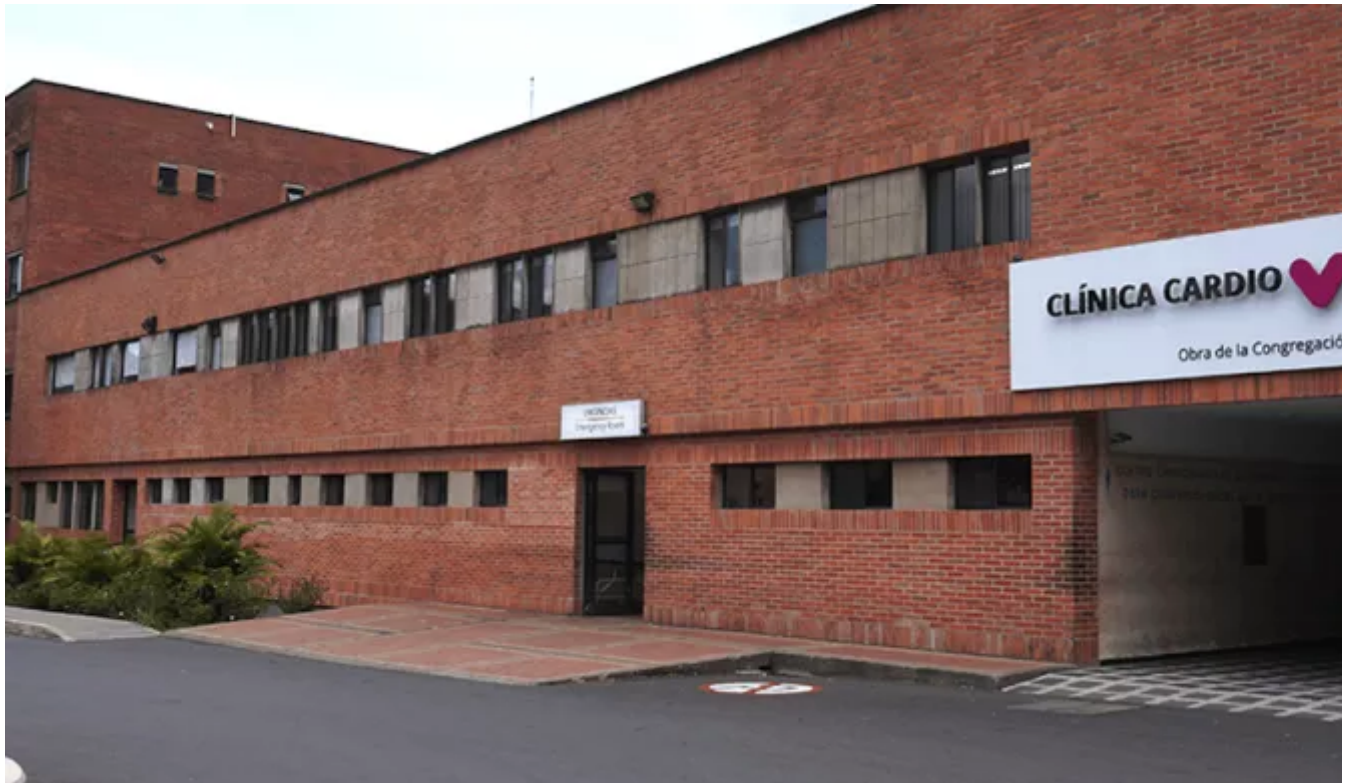
Clínica Cardio Vid