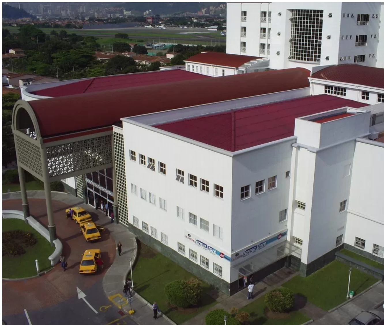
Clínica las Américas