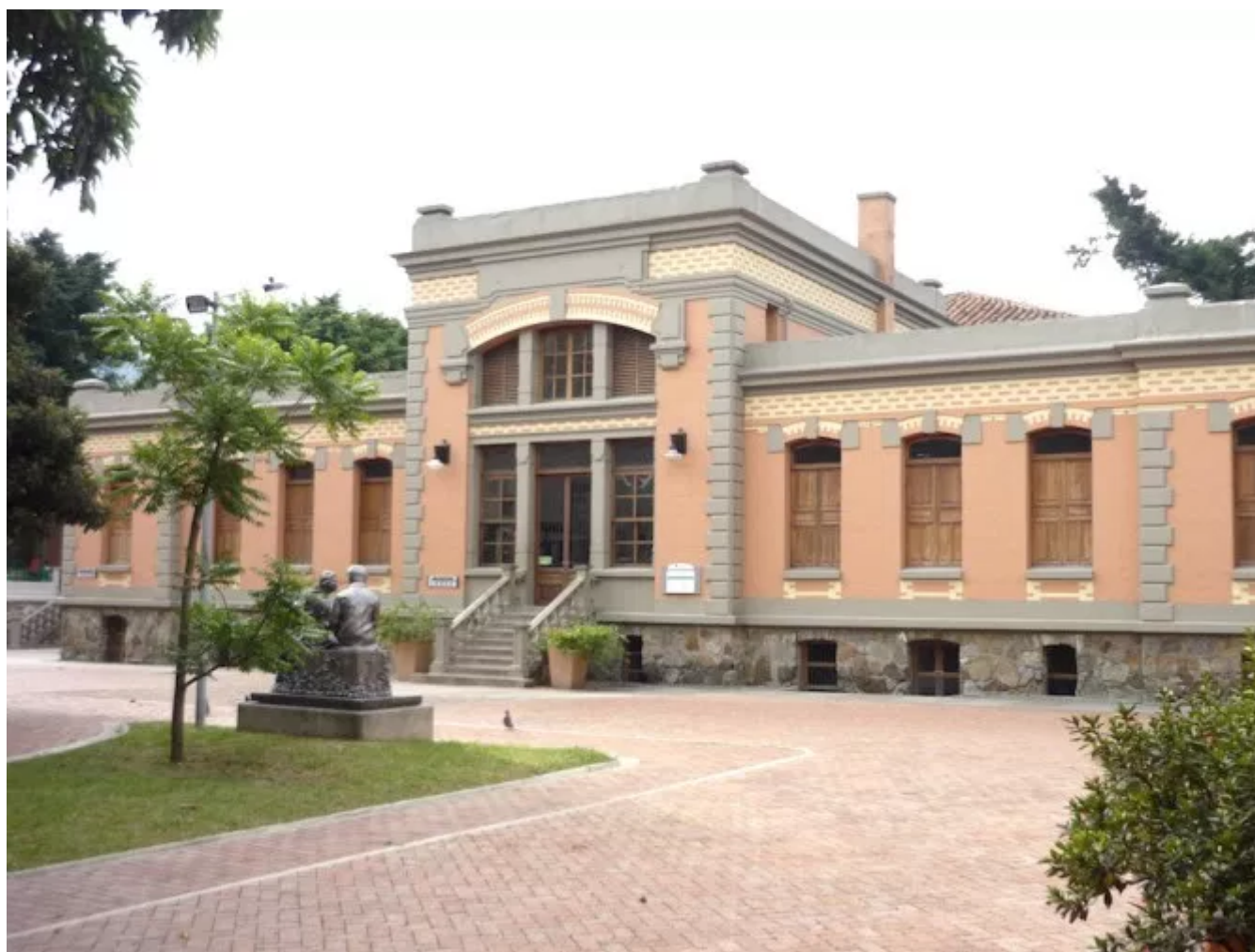
Hospital Universitario de San Vicente Fundación