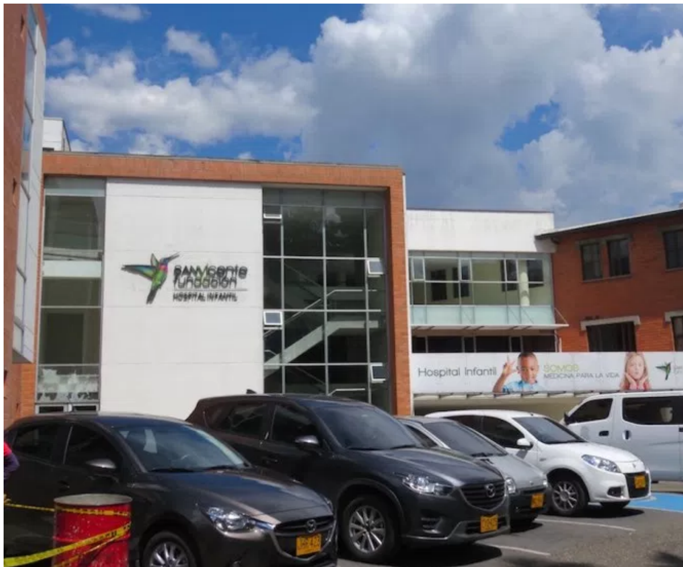
The Infant Hospital at Universitario de San Vicente Fundación

The hospital is one of the largest and most important hospitals in Colombia and Latin / treats over 25,000 patients per year and has over 200,000 medical appointments per y Furthermore, it handles over 16,000 surgeries per year.