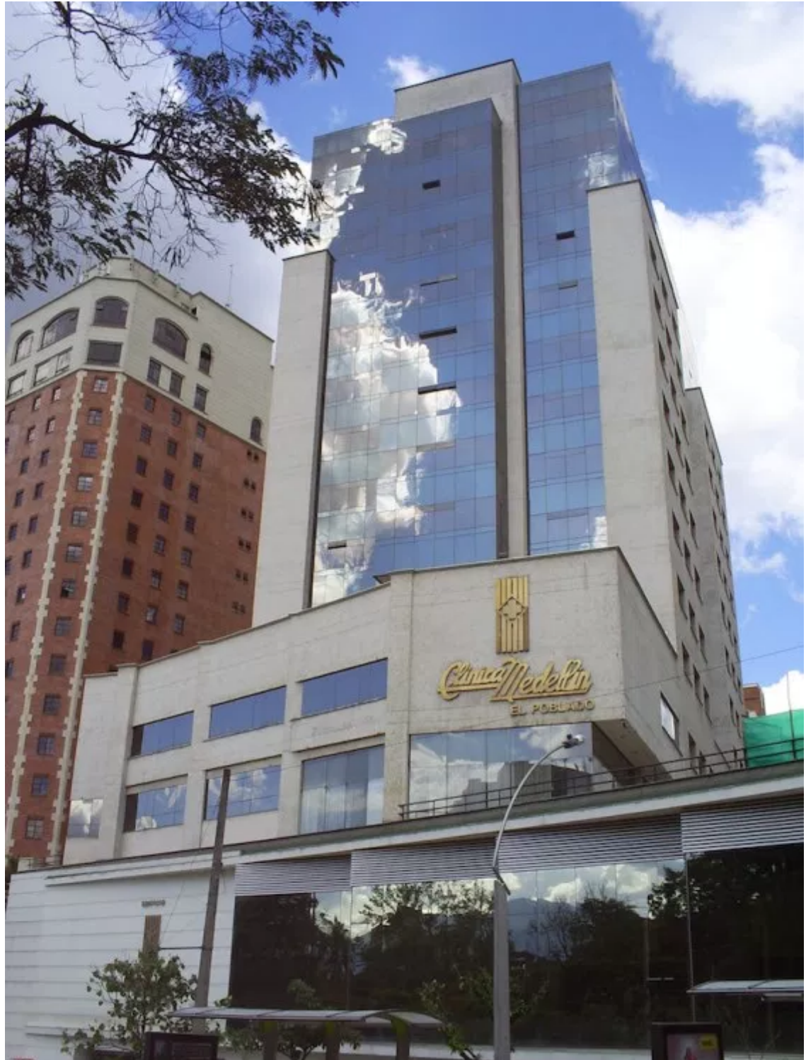
Clínica Medellín in El Poblado

Address: Carrera 72B # 78B-50, Robledo, Medellín