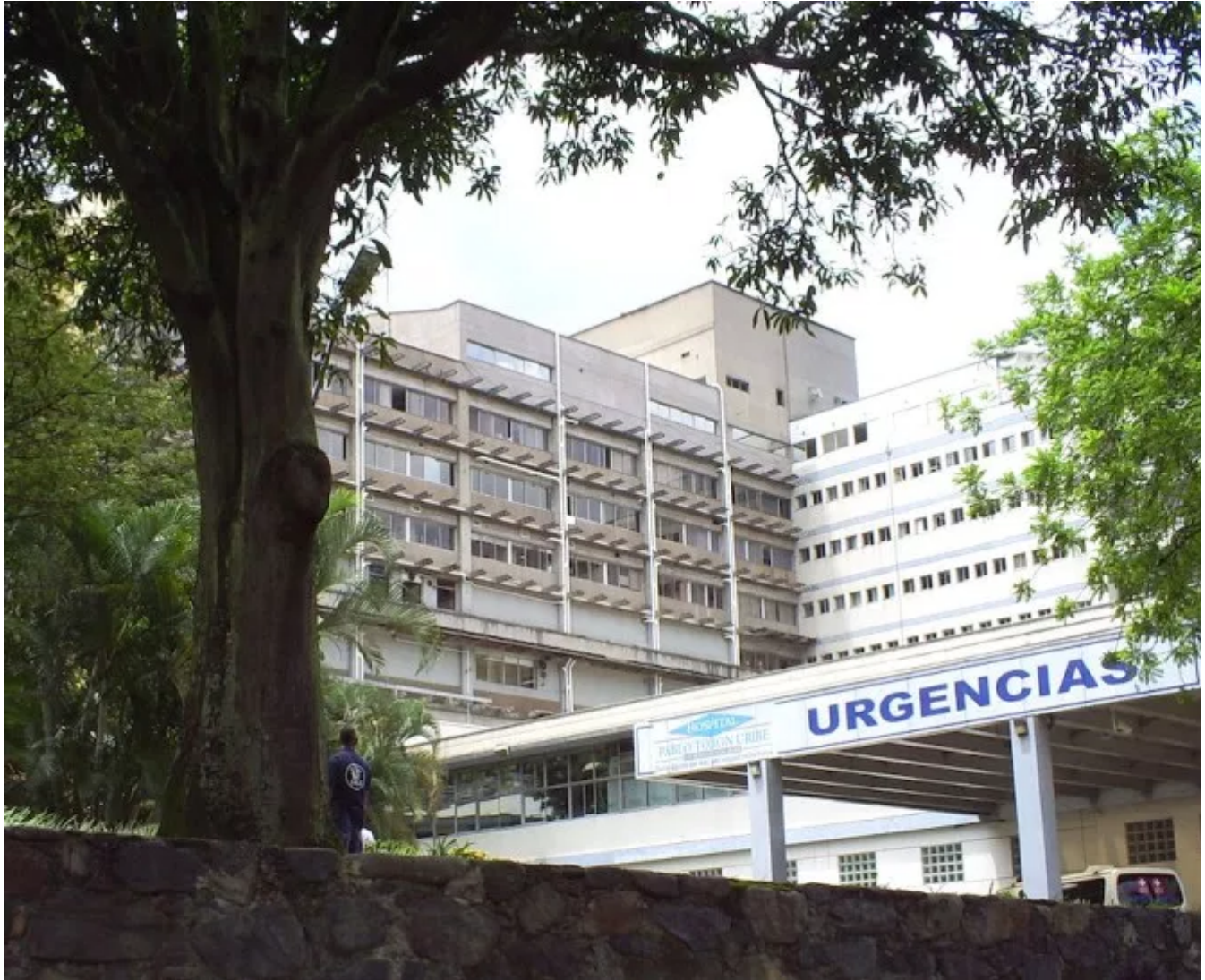
Hospital Pablo Tobón Uribe

The World Health Organization (WHO) ranks Colombia's health system as #22 out of countries it ranked. This is ahead of Germany (#25), Canada (#30), Australia (#32) and United States (#37). Furthermore, no countries in Latin America were ranked better than Colombia by WHO in terms of health systems.