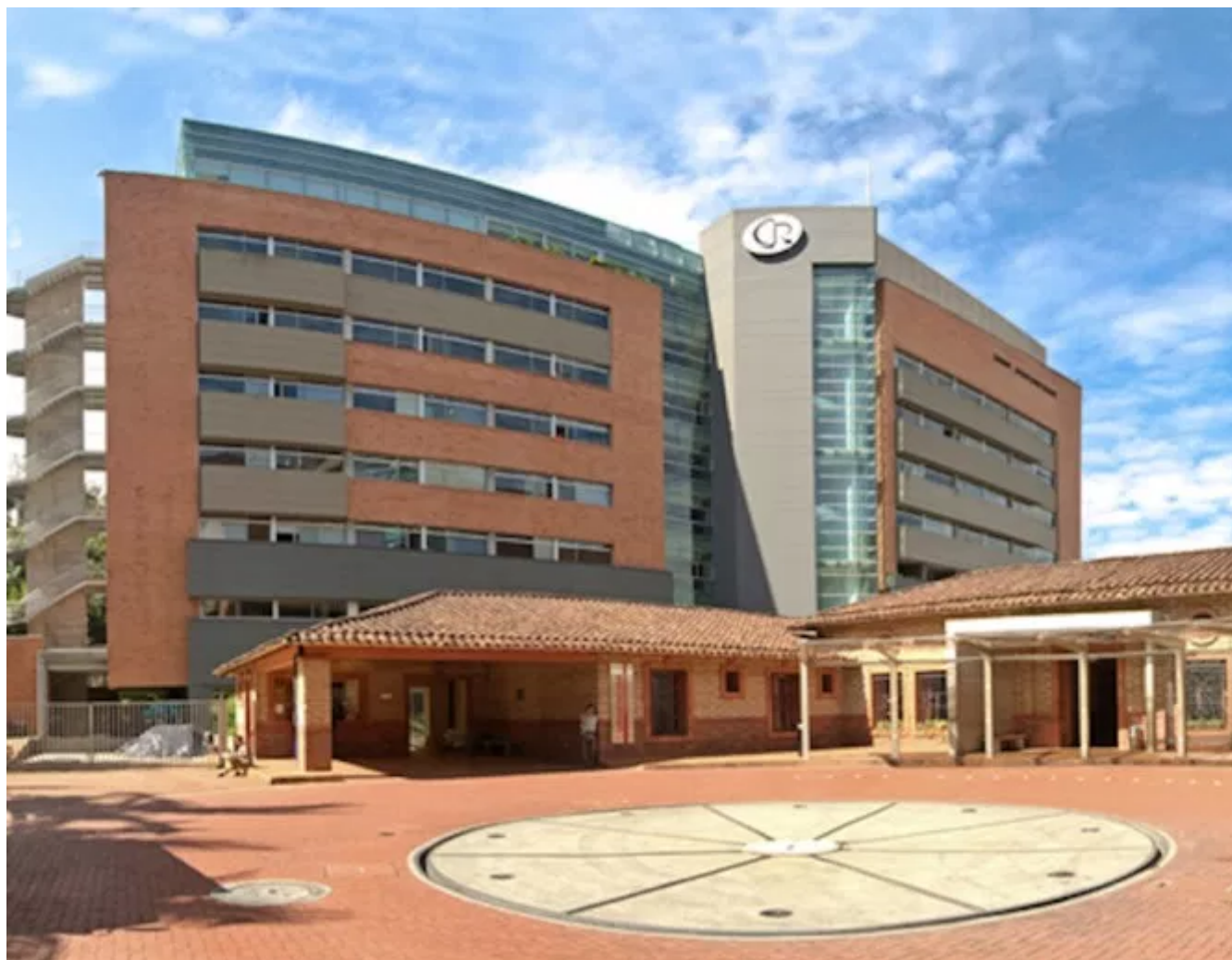
Clínica El Rosario in El Poblado, photo courtesy of Clínica El Rosario