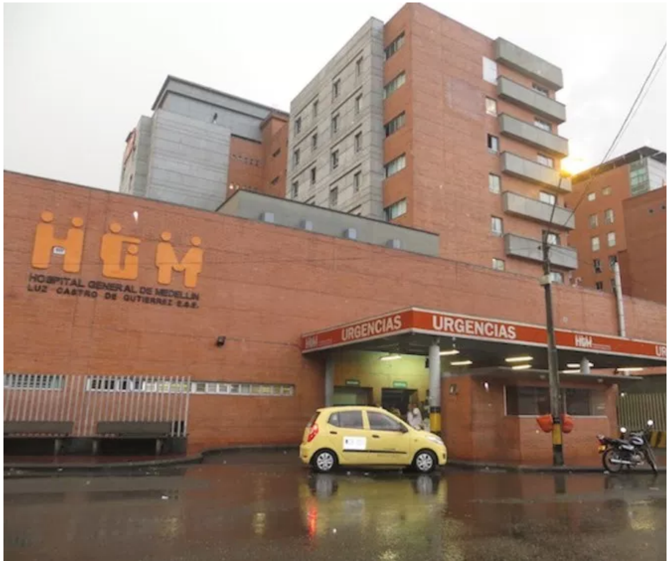
Hospital General de Medellín

Address: Diagonal 75B # 2A-80/140, Medellín