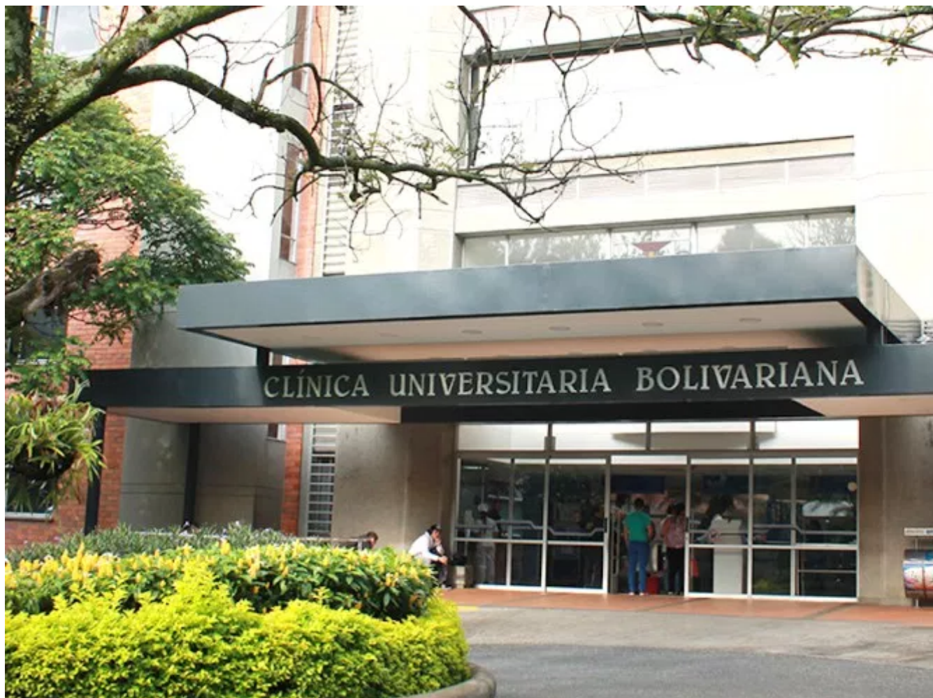
Clínica Universitaria Bolivariana